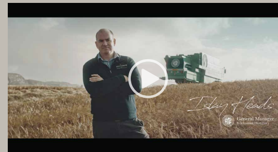
ISLAY HEADS GENERAL MANAGER - VIEW & DOWNLOAD